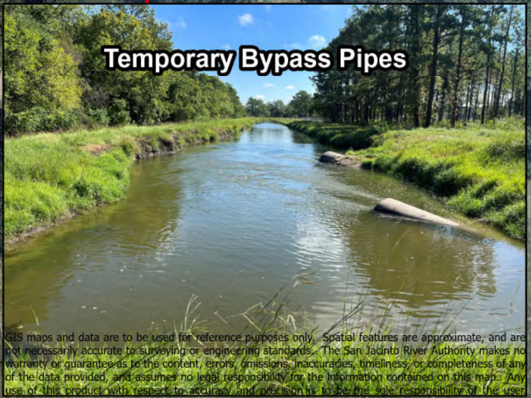
Temporary Bypass Pipes

GIS maps and data are to be used for reference purposes only. Spatial features are approximate, and are not necessarily accurate to surveying or engineering standards. The San Jacinto River Authority makes no warranty or guarantee as to the content, errors, omissions, inaccuracies, timeliness, or completeness of any of the data provided, and assumes no legal responsibility for the information contained on this map. Any use of this product with respect to accuracy and precision is to be the sole responsibility of the user.