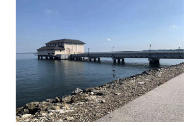
April 22, 2024