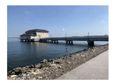
August 19, 2024